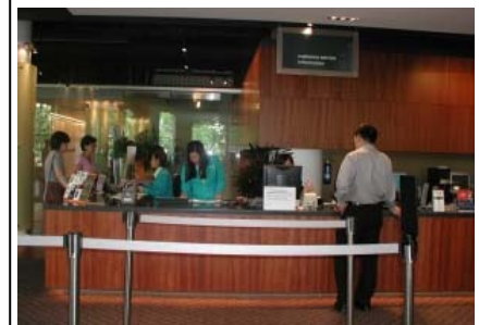
Freed from routine work, librarians may now concentrate on answering specific needs of patrons