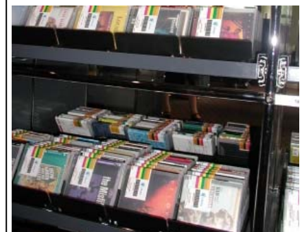
Patrons may now borrow all audio and video items without having to go to the counter