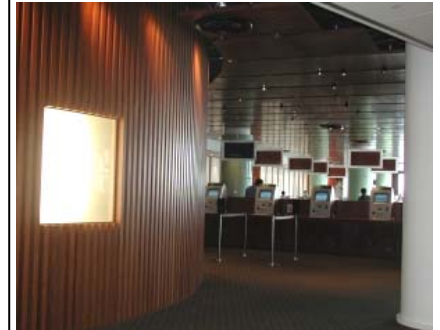
Technology blending with arts